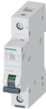
Miniature circuit breaker 230/400 V 6kA, 1-pole, C, 4A